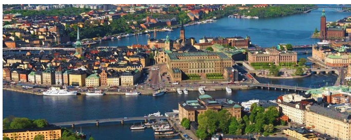
Stockholm and the Old Town.

Welcome to Sweden! Share the legacy of Alfred Nobel and frontier IS research in the cultural and beautiful vicinities of Stockholm and Uppsala.